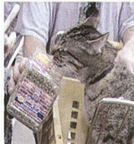
Toker goes shopping and enjoys free samples